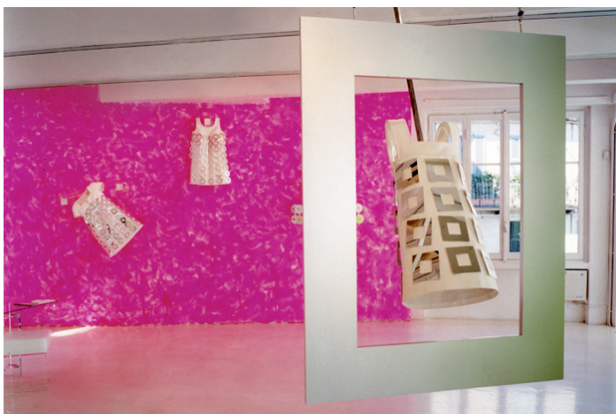
14 Courregès 4 march - 3 april 1999