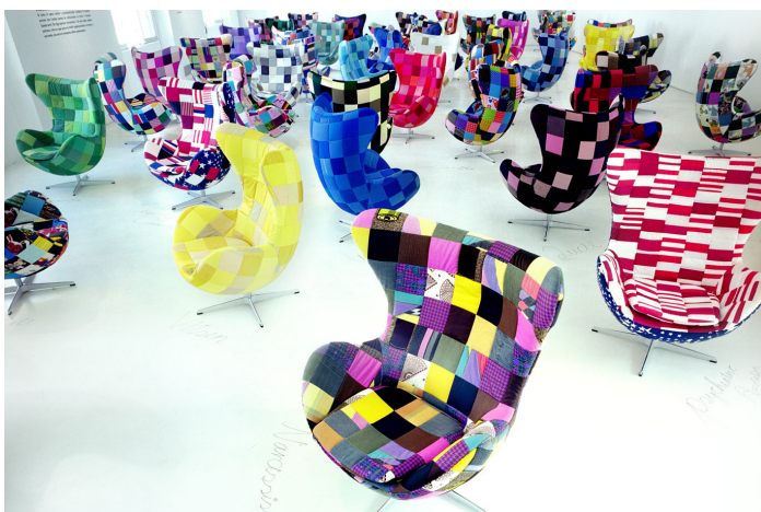
12 Arne Jacobsen 15 - 27 april 2008