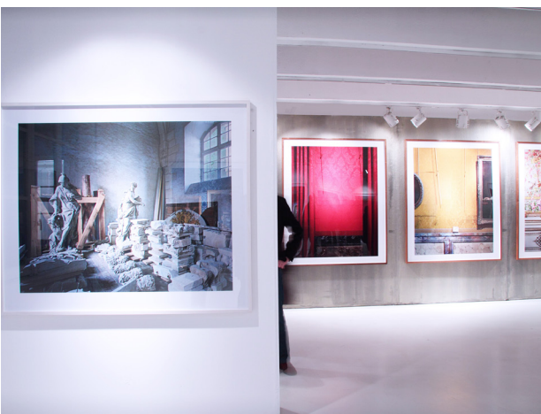
07 Robert Polidori 15 january - 27 march 2011