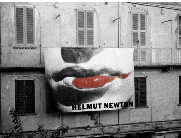
05 Helmut Newton 3 october - 10 november 1996