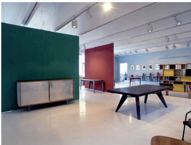
09 Jean Prouvé 12 - 22 april 2000