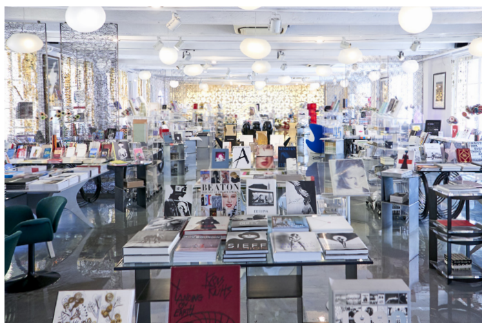
24 Bookshop 2014