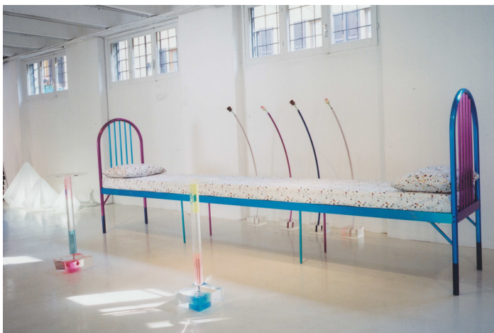
10 Shiro Kuramata 9 april - 11 may 2003