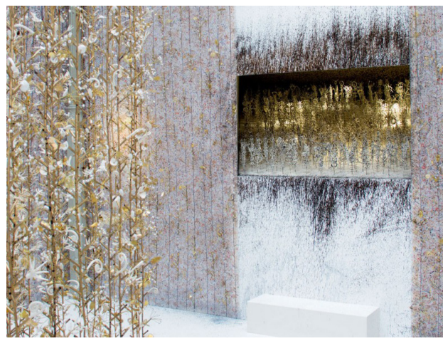
20 Kris Ruhs "Hanging Garden" 11 - 26 april 2015