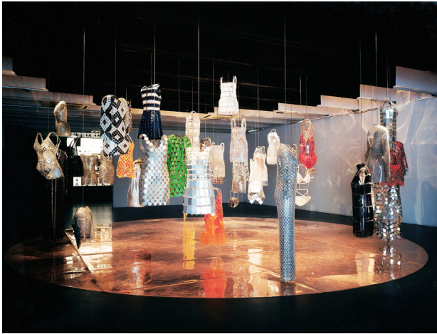
15 Paco Rabanne 25 september - 3 november 2002