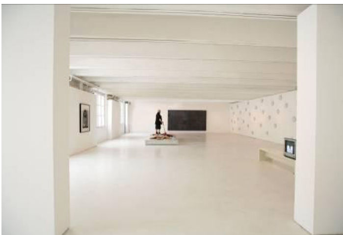
19 Urs Luthi 3 november - 2 december 2007