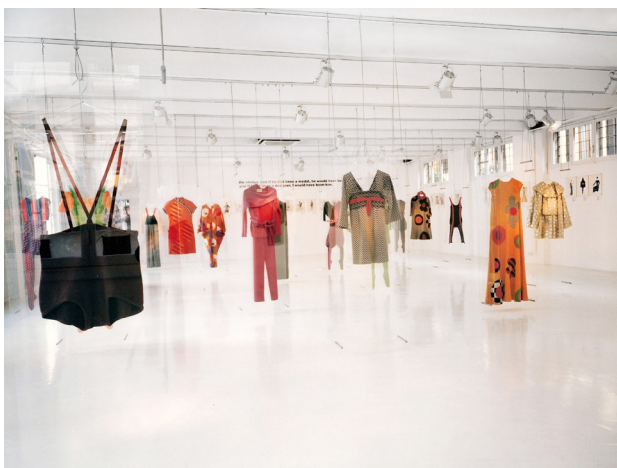
13 Omaggio a Rudi Gernreich 8 october - 15 november 1998