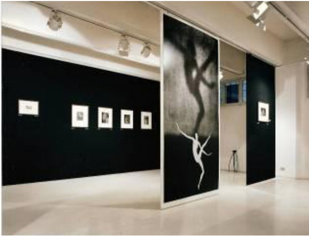
03 Frantisek Drtikol 1 - 31 december 1995