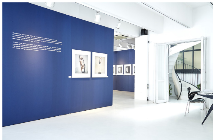
08 David Seidner 3 september - 13 november 2016