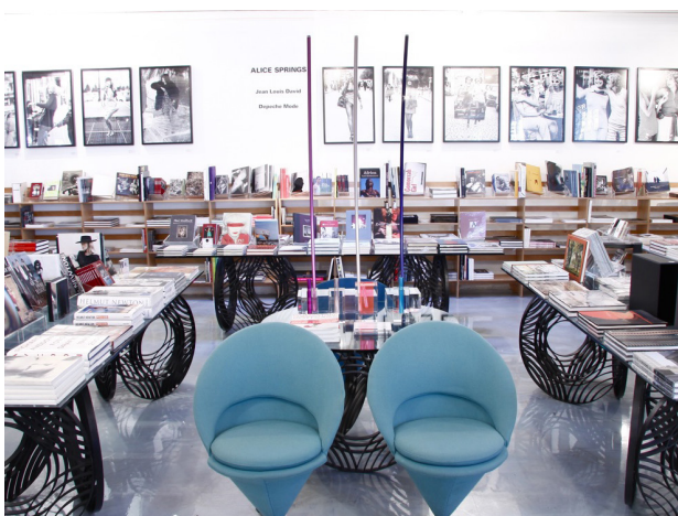
23 Bookshop 2012