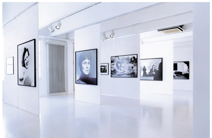
06 Alice Springs, Helmut Newton 29 september - 7 november 1999