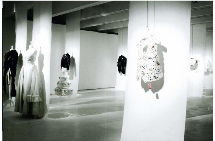
16 Maison Martin Margiela 10 february - 4 march 2007