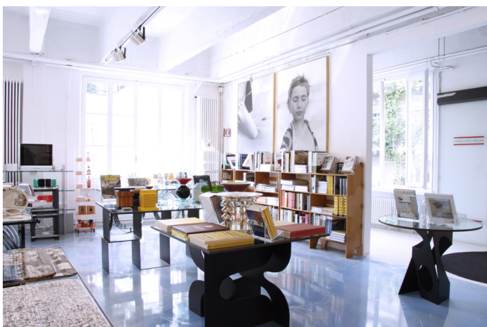
21 Bookshop 2010