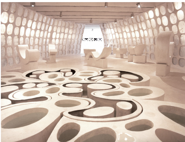
17 Kris Ruhs "Installation" 4 april - 6 may 2001