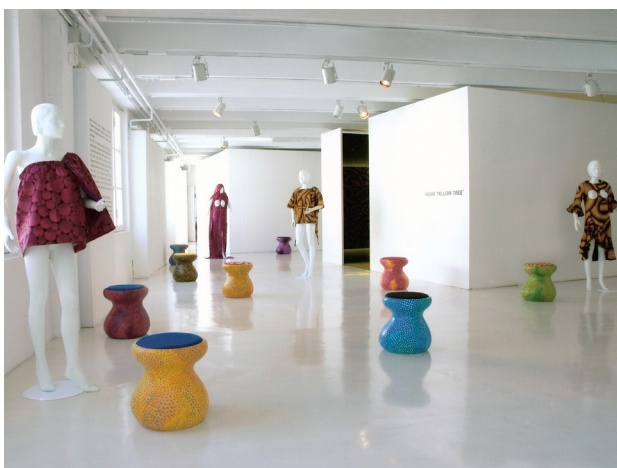
11 Yayoi Kusama 13 april - 1 may 2005